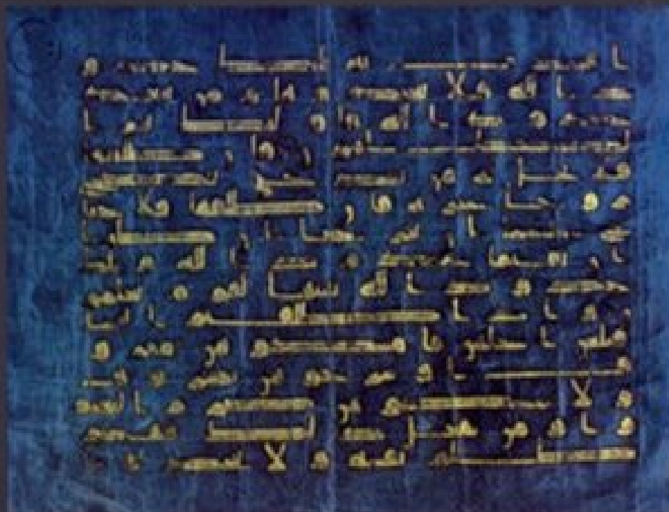
Gold script in gilt on blue vellum from a unique Qur'an of Baghdad (The Cow). Probably copied in Basra in the 10th century.